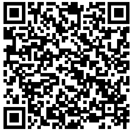
USF Hurricane Guide

ee rnr ee ee rnr ee Yc tcc ee Yc ee c Yc rnr Yc rnr ee Yc Yc ee rnr tee Yc ee Yc rnr ee Yc ee ee Yc! Yc ee P ce ee Yc ee rnr ee tee Yc ee tcc ee Yc c rnr Yc ee tee Yc ee tcc